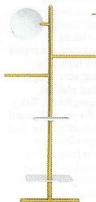
'Camerino' by Brose Fogale, £360, Clippings (clippings.com)

Get your outfit ready for the day with these fashionable clothes horses